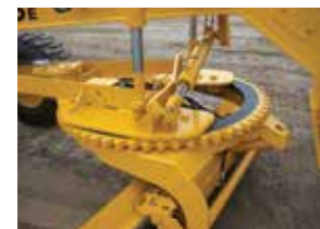
53" gear driven circle with "A" frame allows 360° blade rotation