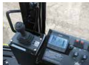
Full power shift transmission with torque converter