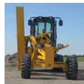
90° Bank slope saddle