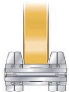
SystemOne Center Tread Idler