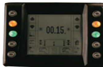
AccuGrade Laser Display