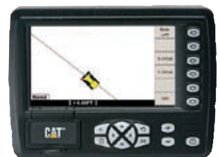
AccuGrade GPS Display