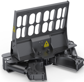
Brushguard with Standard Arm