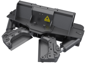
Base model with Standard Arm